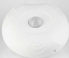
Surface mounted motion sensor