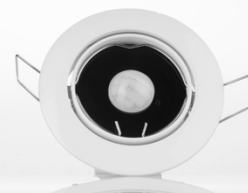
Recess mounted motion sensor