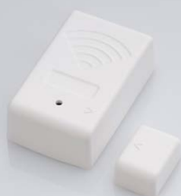
Surface mounted door-window sensor