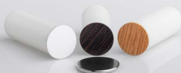
Recess mounted door-window sensor