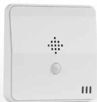
Multibox motion sensor

SEVERAL SENSORS. Up to 20 sensors per room.